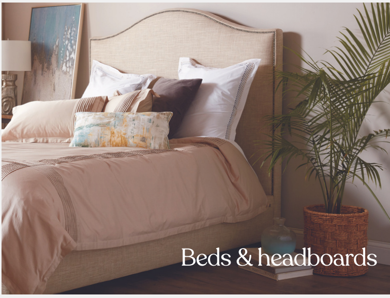
SOFAS | SECTIONALS | OTTOMANS | BENCHES | CHAISES | SLEEPERS | BEDS | HEADBOARDS